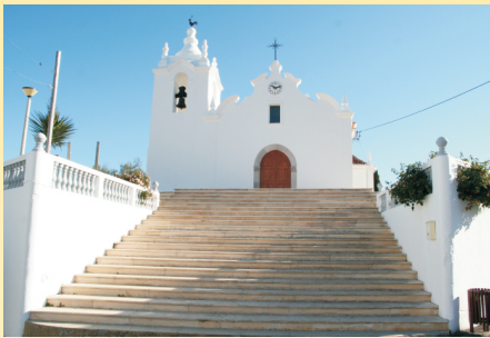
Main Church VAQUEIROS