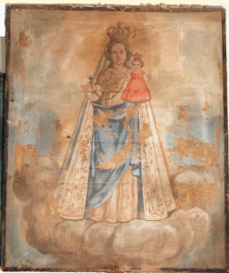
Processional Standard Santa Casa da Misericórdia ALCOUTIM