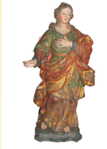
Statue of Our Lady of St Justa Chapel of Our Lady of St Justa SANTA JUSTA – MARTINLONGO