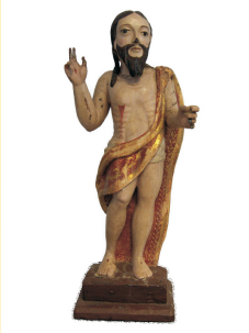
Statue of Christ the Saviour Main Church of Alcoutim ALCOUTIM