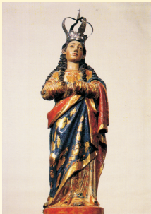
Statue of Our Lady of the Rosary Main Church of Giões GIÕES