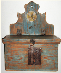
Alms Box Main Church of Pereiro PEREIRO