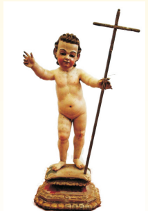
Statue of the Infant Jesus Main Church of Vaqueiros VAQUEIROS